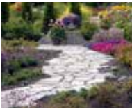
Lawn & Garden