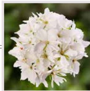
Geranium Starry Pure White

Great series for medium to small sized containers with compact to medium vigor. Great novelty color to add to the series.