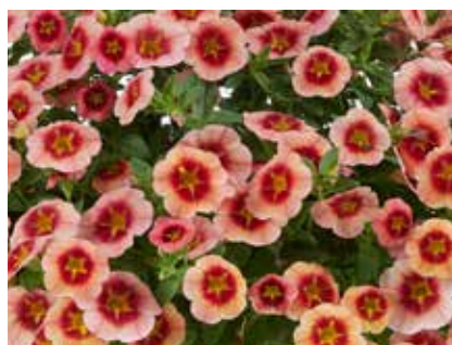
Calibrachoa hybrida Eyconic™ Peach

Brand new series/breeding. Early blooming and very prolific.