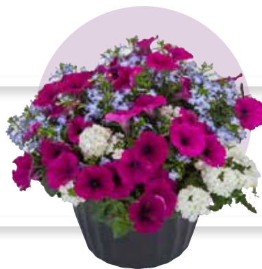
Kwik Kombo™ Midnight Moon™ Mix

Yellow petunias, golden yellow calibrachos and white verbenas.