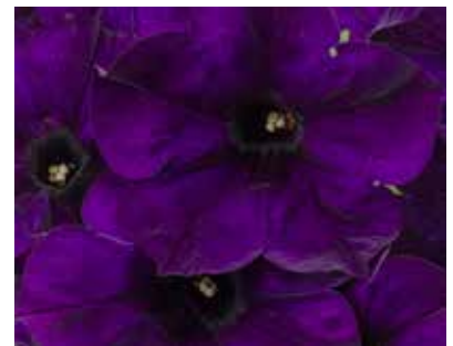
Petunia Crazytunia Night Watch

Magenta blooms with white center. Bloom pattern is rustic and has lighter patches.