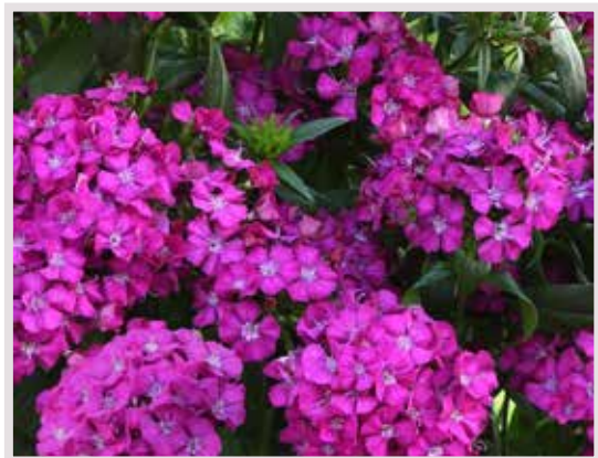
Interspecific Dianthus Jolt™ Purple

Beacon® Impatiens are high resistance to down mildew! Formula Mix is always a favorite for packs.