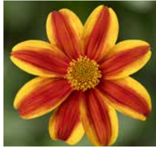
Bidens Brazen™ Samurai

New series with striking colors and unique color pattern. Bright red/orange blooms with a mounded habit and medium vigor.