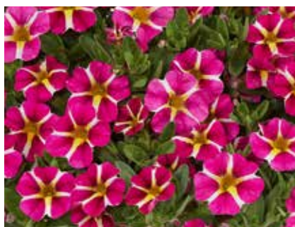
Calibrachoa Colibri™ Pink Bling

Another great double flower for the Colibri™ series.