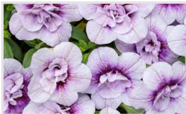
Calibrachoa Superbells® Double Twilight™

A reboot of a classic! Upright, densely branched with bloom power. Use as a thriller in your patio pots.