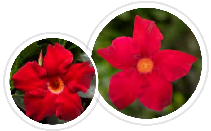
Dipladenia Madinia® Elegant Velvet Red

Bright color with robust coloring for containers and hanging baskets.