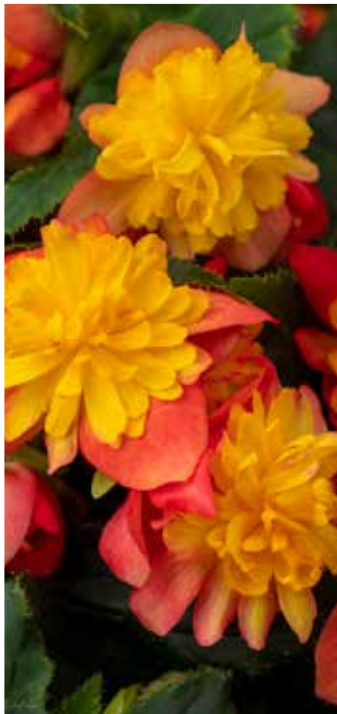
Begonia Rise Up Harlequin

Bicolor to add to the series. Gold and dark orange blooms that hold above the foliage.