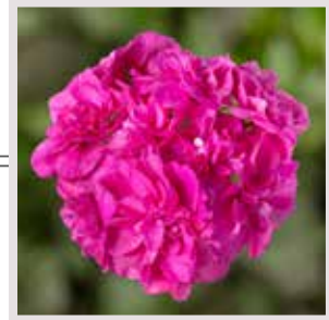
Geranium Ivy League™ Amethyst

Novelty color with unique coloring and single flowers. Perfect for medium to small containers.