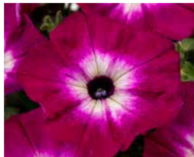
Petunia Crazytunia Magenta Storm

Bicolor to add to the series. Gold and dark orange blooms that hold above the foliage.