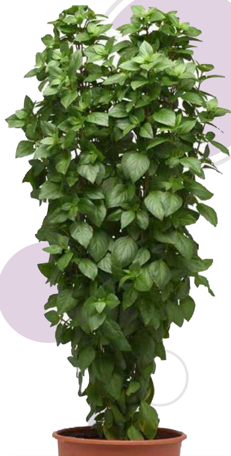
Basil 'Everleaf Thai Towers'

This is a drive-by-bright stunning purple. A great landscape performer to add to the popular Jolt™ series.