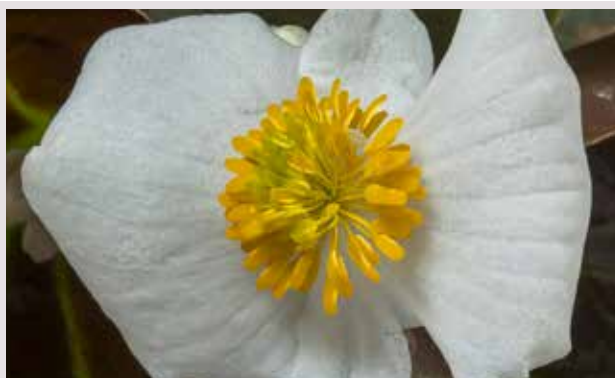
Begonia Bowler™ Bronze Leaf White

Vining variety with huge flowers, established disease resistance and drought tolerance.