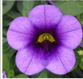
Calibrachoa Callie® Lavender

Vigorous and mounded habit with yellow and rustic red coloring. Great for pollinators.