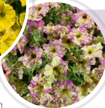
Petunia Splash Dance™ Poppin 'Pink'

High density petunia, naturally grows compact. A bright true yellow color.