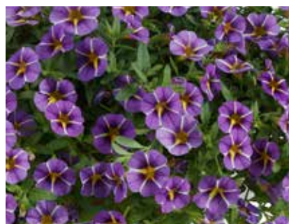
Calibrachoa Colibri™ Purple Bling

Great for high density growing. Fun new pattern.