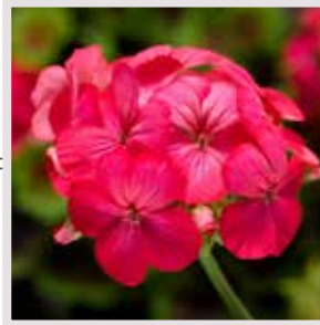
Geranium Exotica™ Coral Sunrise

Medium vigor with dark foliage and dark red blooms. Non-stop flowering all season long.