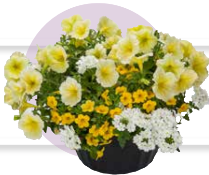
Kwik Kombo™ Banana Pancakes™ Mix

Ruffled edges of pure white flowers. Very fun novelty color to mix with other components in small mixed containers.