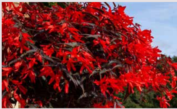
Begonia Bossa Nova™ Night Fever Rosso

Strawberry colored flowers with a dark throat and yellow center. Outstanding mixer for planters and combinations.