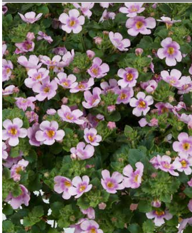
Bacopa Scopia® Gulliver™ Compact Blush

Great mounding habit. Customers can't get enough of these speckled Petunias.