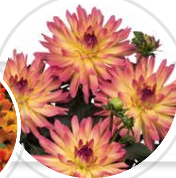
Dahlia MegaBloom Passion Fruit

Cactus style bloom with a peach/yellow center with pink tips.