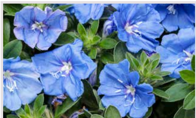
Blue My Mind® XL Evolvulus

Silver lavender fully double-flowered. Mixes perfectly in elegant recipes. Tremendous impulse appeal!