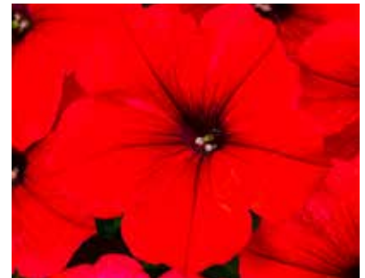
Petunia Hells Forge

Orange/red coloring with a pink and black throat. Very bright!