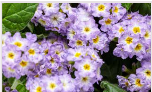
Augusta® Lavender Heliotropium

Mixed recipe in a basket or a stand alone. Robust trailing Angelonia with plenty of flower power.