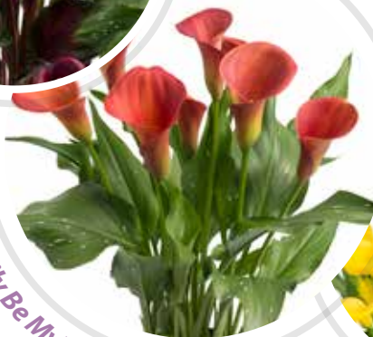
Calla Lily Be My™ Main Squeeze