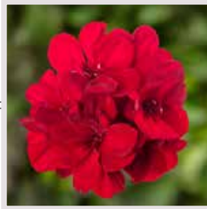
Geranium Calliope® Medium Dark Red Dark Leaf

Matches others in the series with bright white blooms and large foliage.