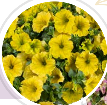
Petunia Capella™ Hello Yellow

High density petunia, naturally grows compact. A bright true yellow color.