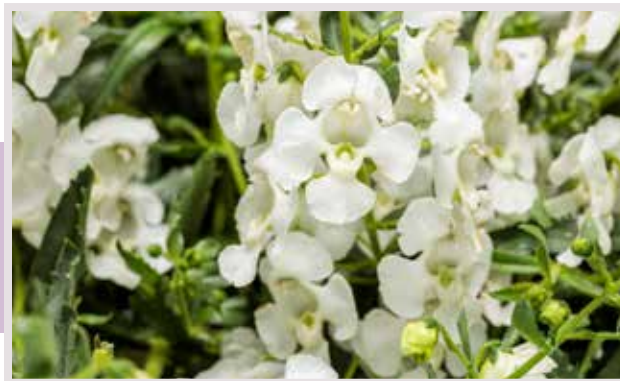
Angelonia Angelface® Cascade Snow

Elegant robust pearl white flowers on the best Ageratum on the market.