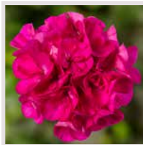
Geranium Mojo™ Dark Pink

Heat tolerant and strong branches makes it a desirable plant. Light to medium purple flowers.