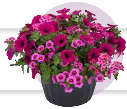
Kwik Kombo™ Summer Jelly™ Mix

Purple petunias with white verbenas and light blue lobelia.