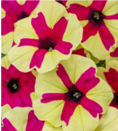
Petunia Big Deal Fingerprint

Robust and vigorous plants with changing pattern of cherry coloring and pale yellow edges.