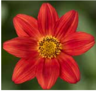
Bidens Brazen™ Rising Sun

New series with striking colors and unique color pattern. Bright red/orange blooms with a mounded habit and medium vigor.