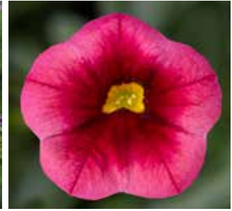
Calibrachoa Callie® Rose Dark Center

Lavender colored flowers with a dark throat and yellow center. Mixes well with other plants and blooms all summer long.