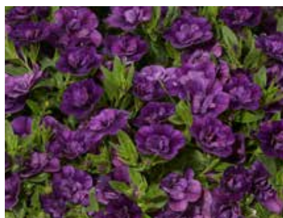
Calibrachoa Colibri™ Double Deep Purple

Another new pattern for the Colibri series. Total 17 colors for Colibri™.