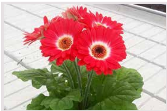
Gerbera ColorBloom™ Bicolor Red White

Colorbloom stays compact & tidy. This Bicolor Red White is a unique color addition with its white ring around the center.