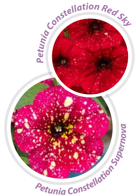
Petunia Constellation Red Sky

Clear blue and purple shade that gives dimension and striking color for combinations. Compact and mounded habit.