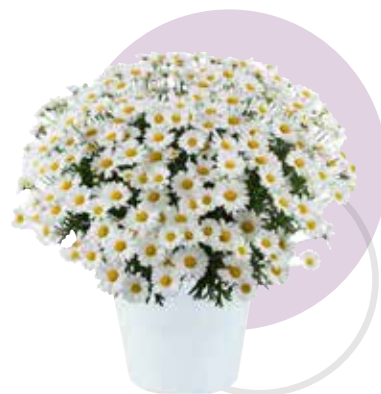
Argranthemum frutescens Lollies™ White Chocolate

Brand new series/breeding. Early blooming and very prolific.