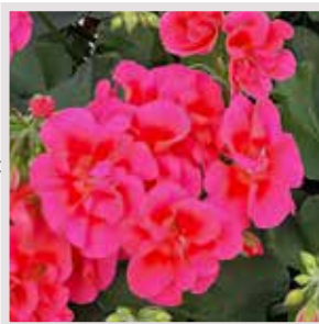
Geranium Moxie!™ Pink Splash

Dark foliage with dark pink flowers. Medium vigor and well-branched for a variety of container sizes.