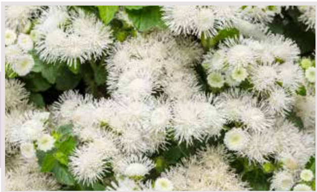
Ageratum Artist® Pearl

Elegant robust pearl white flowers on the best Ageratum on the market.