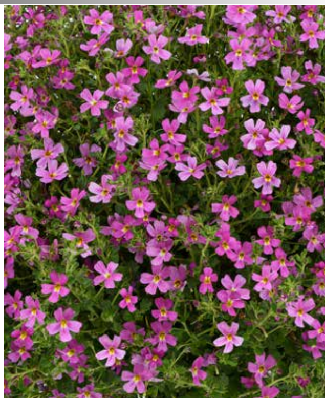
James Brittenia Stardom™ Pink

Large flower with good branching. Great for combinations. Pink with a dark pink center.