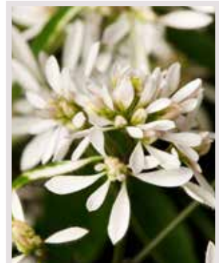
Euphorbia Euphoric™ Double White

Eye-catching colors with improved seed quality and easy production for superior performance.