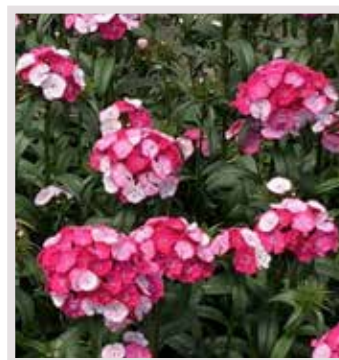
Dianthus Sweet™ Rose Magic

This Dianthus is a beautiful purple that stands out in a bouquet or in the garden. Stems are 18 - 36".