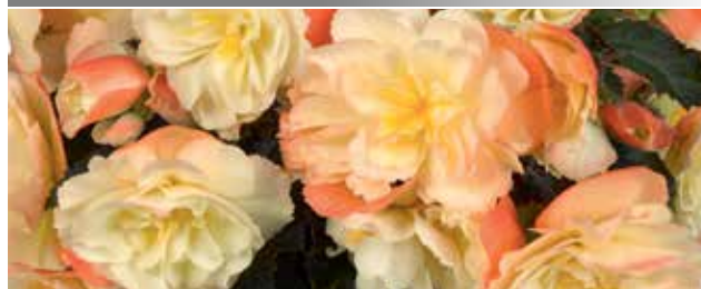
Begonia l'Conia® Scentiment™ Peachy Keen

Selected for hanging baskets and premium containers. Bicolor blooms with heat-tolerance for sun and shade.