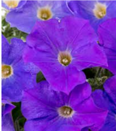
Petunia Perfectunia Sky Blue

Robust and vigorous plants with changing pattern of cherry coloring and pale yellow edges.