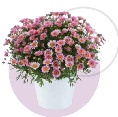
Argranthemum frutescens Lollies™ Marshmallow

Brand new series/breeding. Early blooming and very prolific.