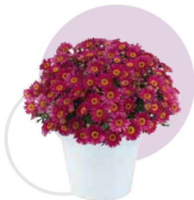
Argranthemum frutescens Lollies™ Berry Gummy

Brand new series/breeding. Early blooming and very prolific.