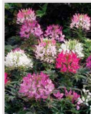
Cleome Sparkler™ 2.0 Mix

Interspecific begonia with bronze foliage with white flowers and mounded habit. 12-18" high with 20-24" spread.