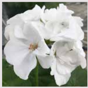
Geranium Calliope® Large White

Matches others in the series with bright white blooms and large foliage.