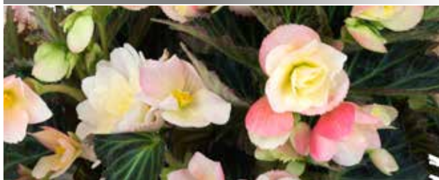
Begonia l'Conia® Lemon Berry

Selected for hanging baskets and premium containers. Bicolor blooms with heat-tolerance for sun and shade.