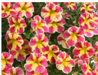
Calibrachoa Colibri™ Abstract Guava

Semi trailing with an extra large flower. This peach color is more spectacular than a photo can express.