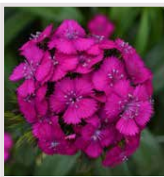
Dianthus Sweet™ Neon Purple

Colorbloom stays compact & tidy. This Bicolor Red White is a unique color addition with its white ring around the center.